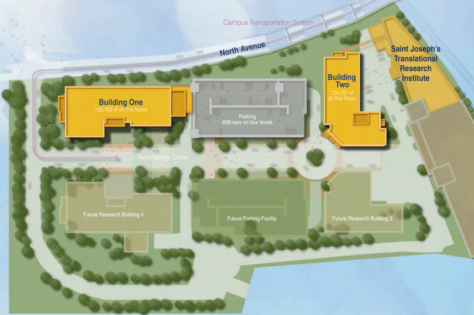
Master Plan Detail

For more information contact Gateway Development Services at 404-214-6900